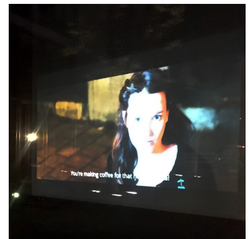
Screening „Bobby Brown“